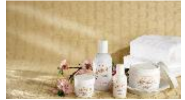
4 Step Facial.